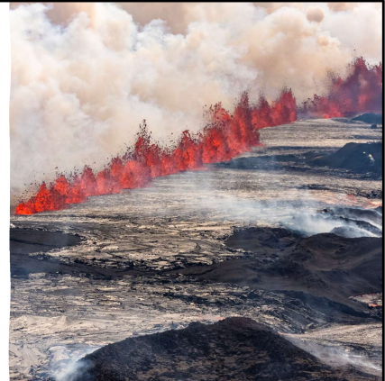
Near Grindavík 2024