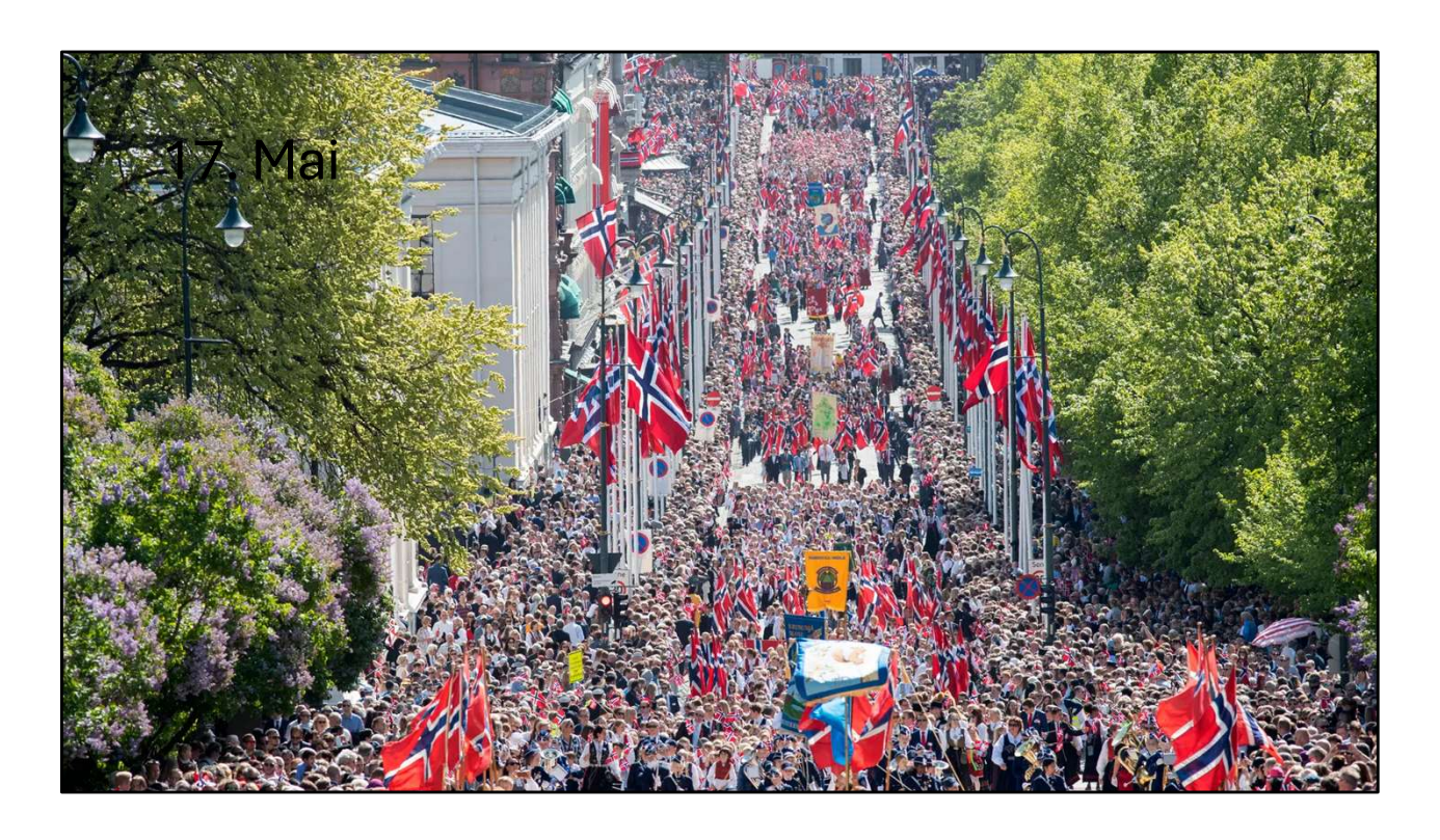
17<sup>th</sup> of may is Norway`s national day. Here in Norway, we usually celebrate it by going in a parade and eating very much ice cream and hot dogs.

In Norway we have something called "russ". They celebrate finishing 13 years of school. When celebrating they party all night, do challenges, drink some alcohol and have fun. At 17 of May they have cards called "russekort". On the cards there is a picture of them and some information of the person. They run with the parade and throw these cards, and other people can collect them. Some cards have different color and rareity, the red cards are the most common.