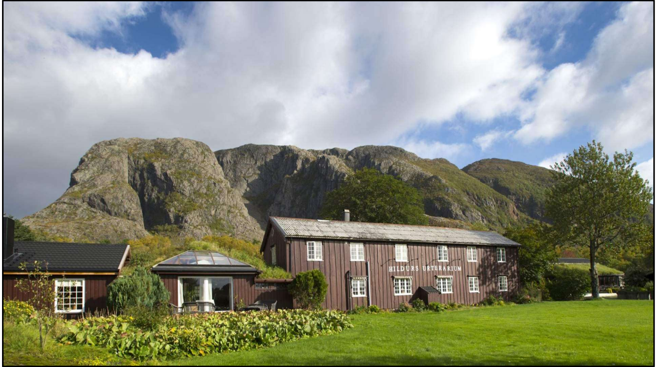
Hildurs – a must visit restaurant, where you also can sleep.