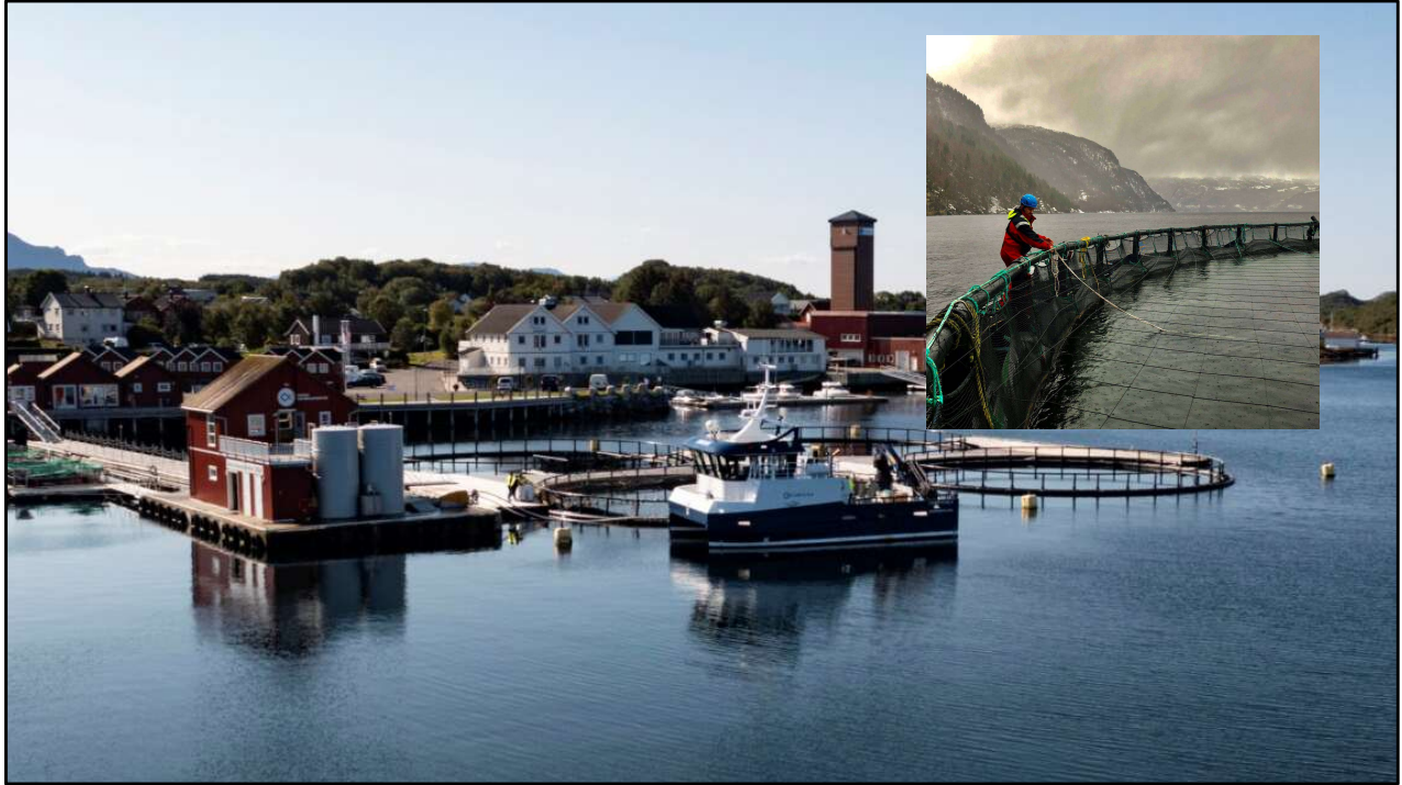
toft – farming fish