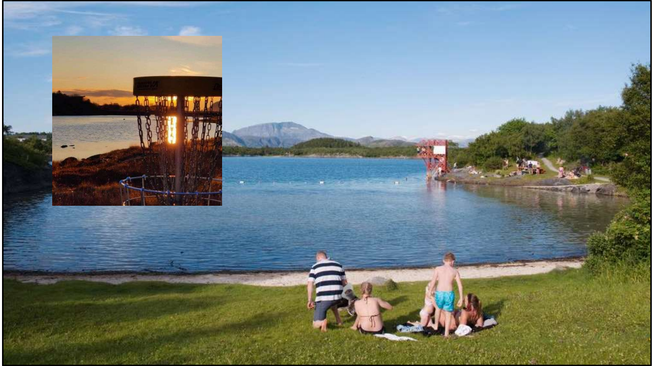
Svarthoppen, a lake close to the center of the town. A great place to hang out in the summer.