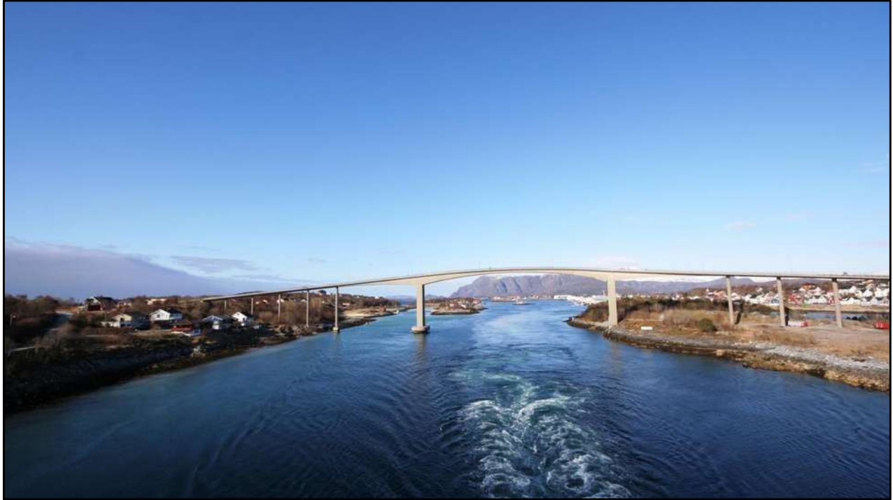
The Brønnøysund bridge, one of the big structures in brønnøysund.