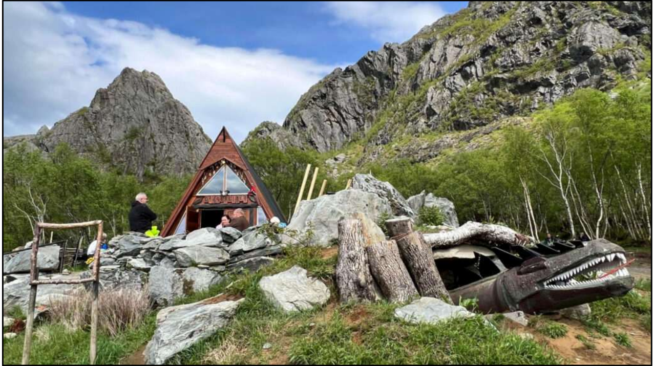
Dragereiret, is located behind Hildurs, a nature path up to the dragon's nest.