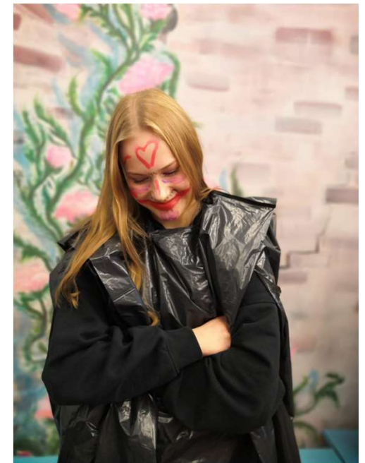
First graders baptism